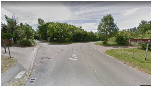
Roxley Court Lane is off the Wymondley Road.

Although the car park is not large we have never been there and discovered that it is too full to park.