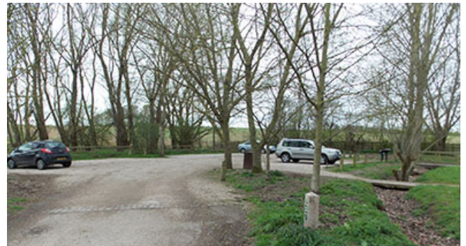
Manor Wood car park.

Walk: From the car park set off along the sandy path, past the carving of Telford Morton, through the wooden gates at the end of the path, and across the Wymondley Road. Walk into the woods and find your way to the large field shown in the picture. Thereafter follow the route shown, or else do your own thing.