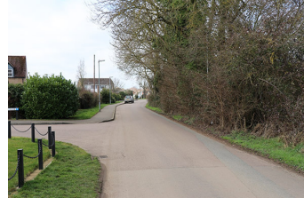
Just outside there is ample parking on the road - no yellow lines.

Walk: Our website video shows a circular walk which takes about 1 hr 20 mins, but there are several ways to walk, and you don't have to walk for so long. The Visitor Centre supplies free way-marked guides. This pdf is not really needed at Paxton Pits. However, our route was as follows: From the Visitor Centre follow the sign that says Meadow and River Trails .