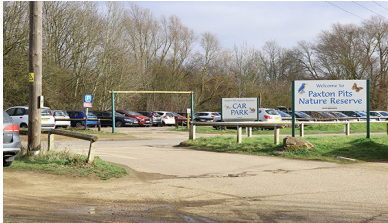
Paxton Pits free Car Park

Parking: Paxton Pits has its own free parking area, which can occasionally get full on a warm, busy day. However, there is plenty of space just outside in the High Street where there are no yellow lines.